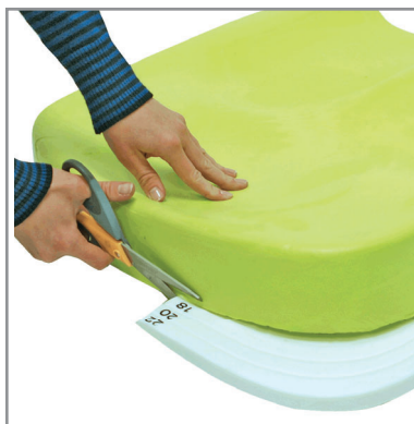
POK – Pelvic Obliquity Kit (2 pieces) accommodates up to one inch of obliquity

HCPSC Code: Pediatric/Standard - E2605 Heavy-Duty - E2606