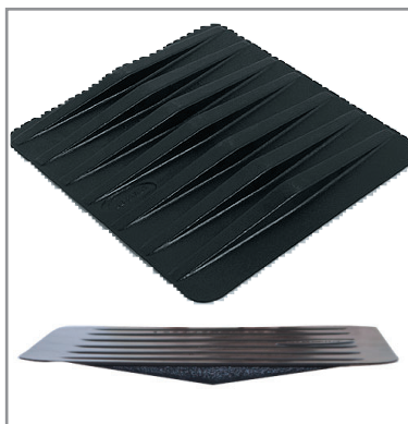
Cushion Rigidizer – lightweight and low profile